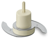
WCG501TX Chopping Blade