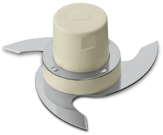
WCG502TX Grinding Blade