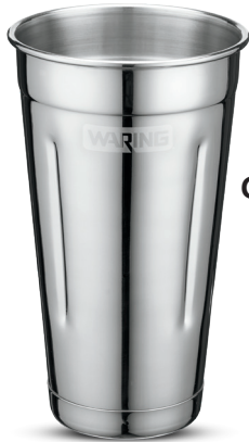
CAC20 Stainless Steel Malt Cup