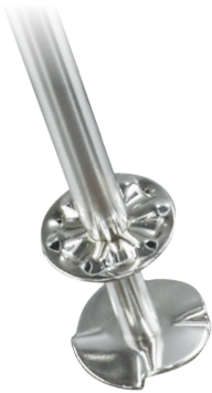
CAC112 Solid Agitator