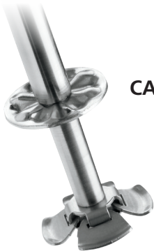
CAC123 Butterfly Agitator (6 pack)