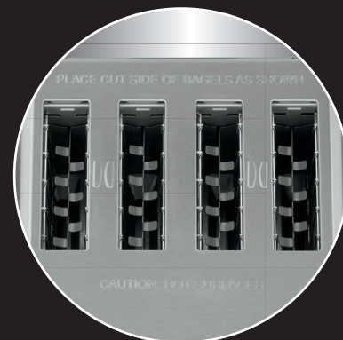
Wide toasting slots