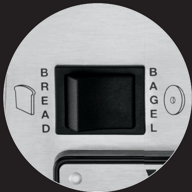
WCT850 Bread/Bagel selector switch toasts only one side of bagel