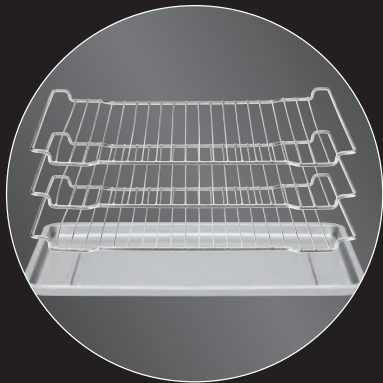
WCO500X: 3 baking racks and 1 half-size sheet pan included