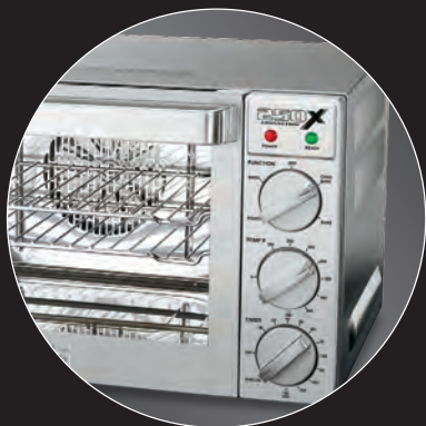
WCO250X: 2 baking racks and 1 quarter-size sheet pan included