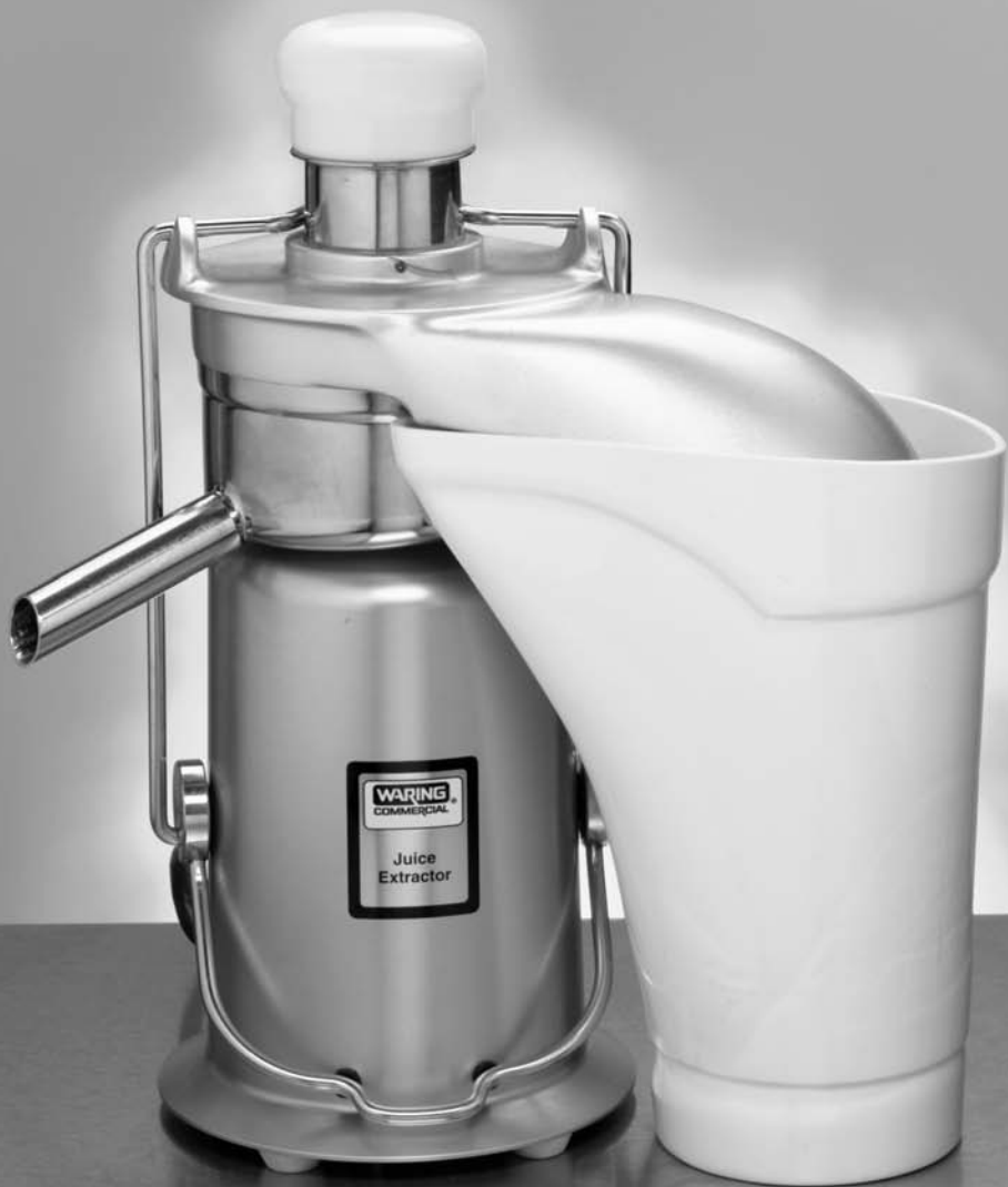
JE2000 JUICE EXTRACTOR WITH PULP EJECTOR