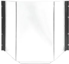
WDM500SG Splash Guard