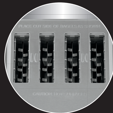
Wide toasting slots