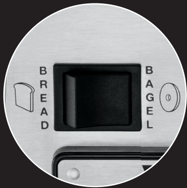
WCT850 Bread/Bagel selector switch toasts only one side of bagel