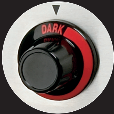
Electronic browning controls