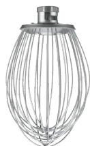
WSM20LW Stainless Steel Chef's Whisk