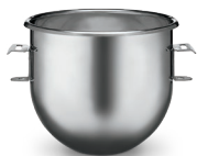
WSM20LBL 20-Quart Stainless Steel Bowl

Special shipping requirements needed. Machines ship in large wood crates via courier service.