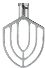
WSM20LMP Aluminum Mixing Paddle