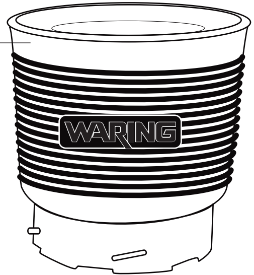
035138 Grinding Bowl Assembly