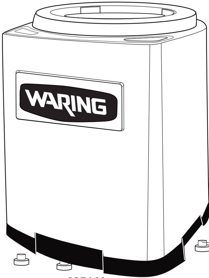
035140 WSG60 Base Unit (comes complete with motor coupling and feet)